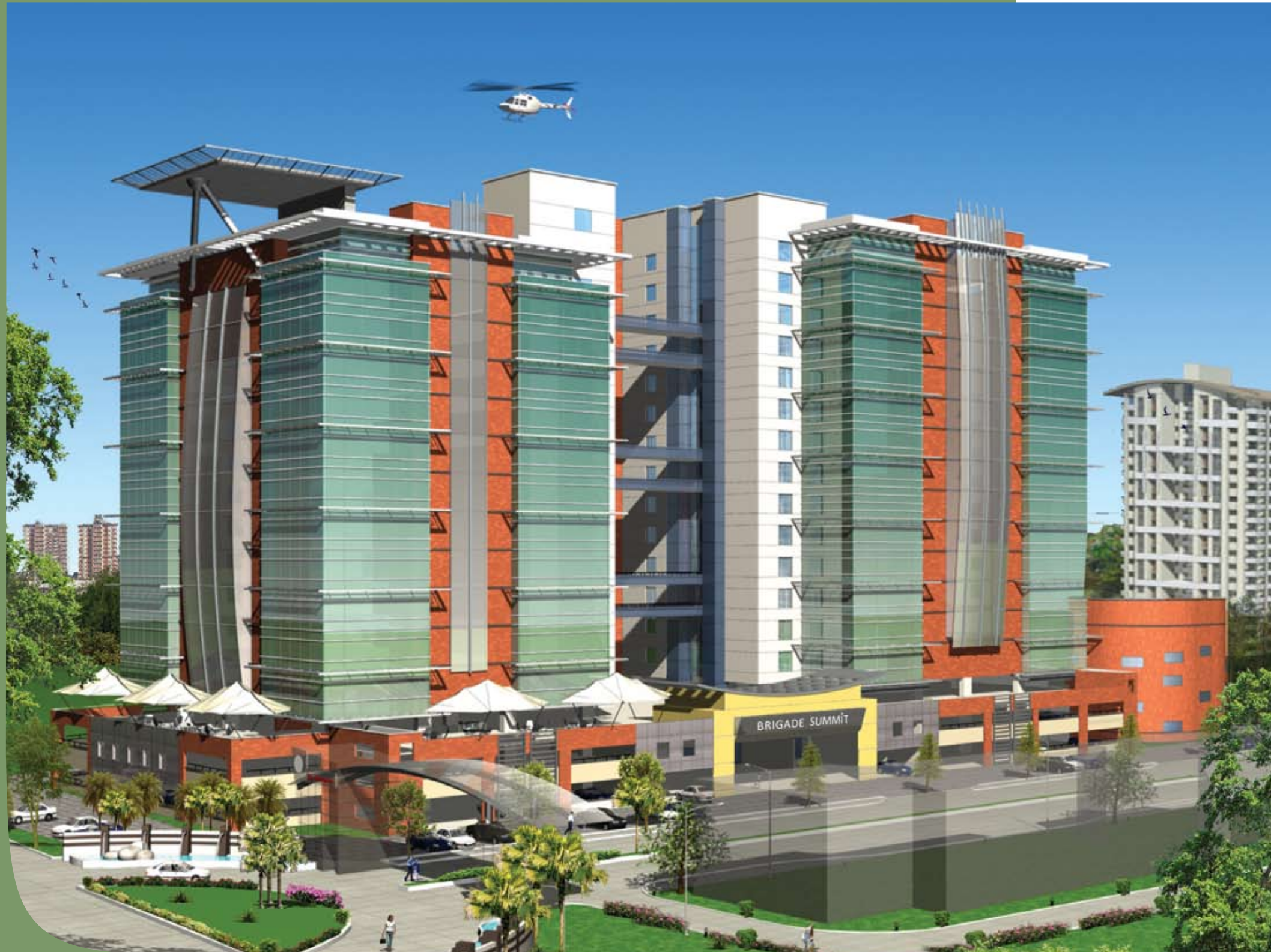
Summit I & II, viewed from the Promenade