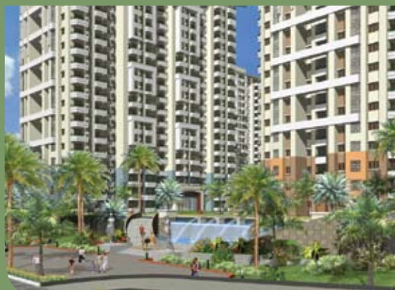
Water feature at the entrance to the residential section