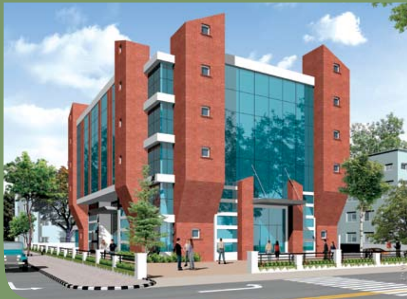
Brigade Point, Gokulam Rd, Mysore