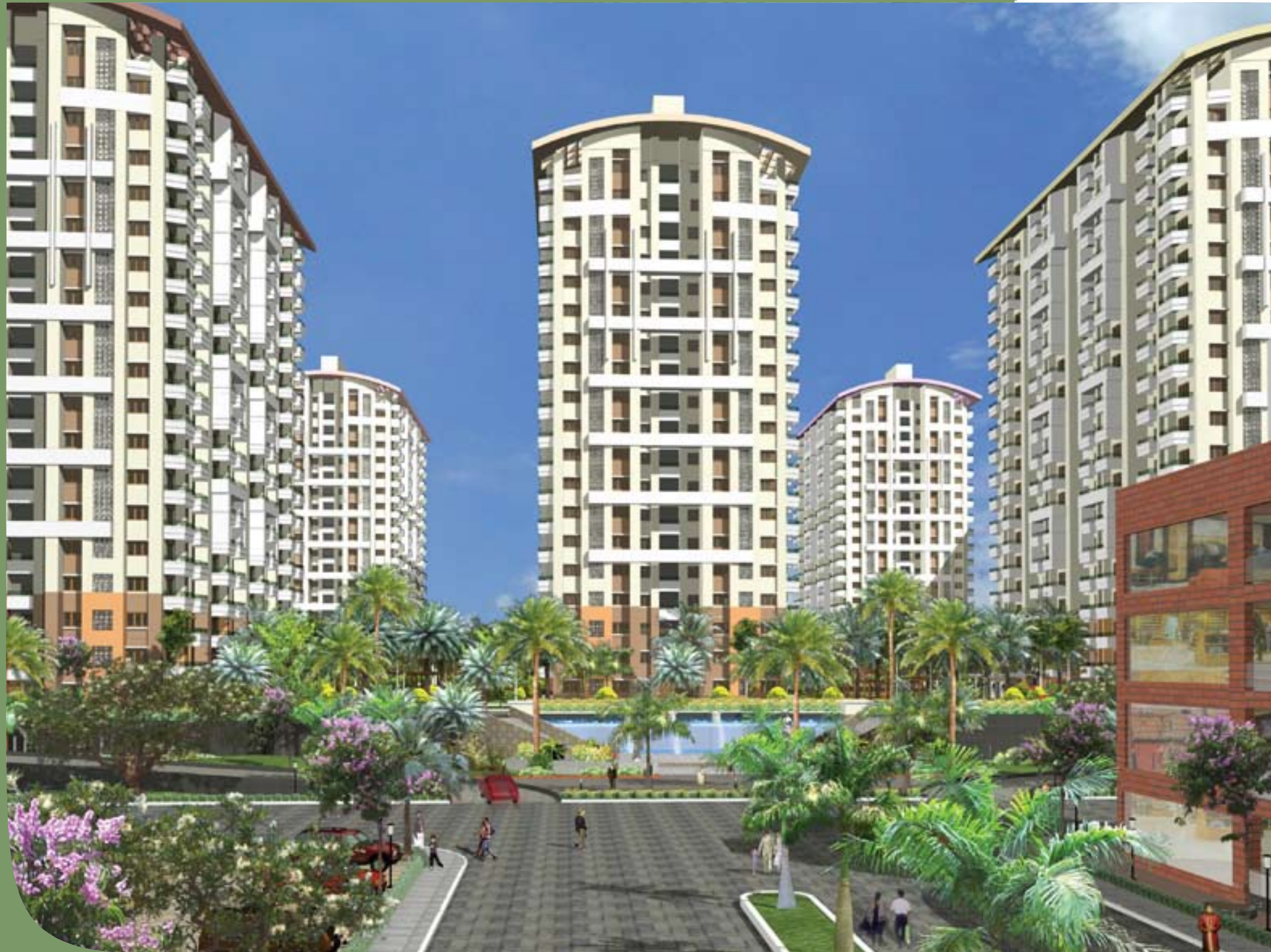
Entrance to the residential section at Brigade Metropolis