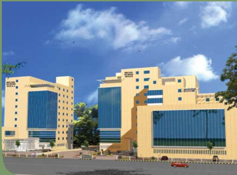
Brigade TechPark Whitefield Rd, next to ITPL