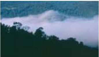
Horanadu (100 km from Chikmagalur), covered by mist

Located in the Baba Budan range is a very unusual shrine: the Inam Dattatreya Peetha. Here a laterite cave is believed to have sheltered, at different times, both Muni Dattatreya (an incarnation of Brahma-Vishnu-Shiva) and the Muslim saint Hazrat Dada Hayath Mir Khalandar, sent to India by Prophet Mohammed. Both Hindus and Muslims visit the shrine seeking blessings.