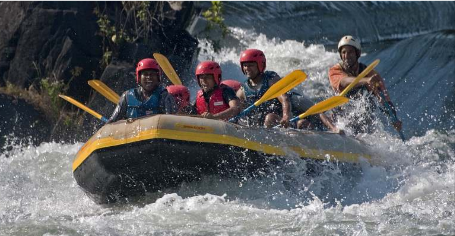
White-water rafting near Agumbe (105 km from Chikmagalur)