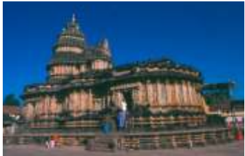
Vidyashankara Temple, Sringeri

According to legend, Adi Shankaracharya passed away on the banks of the Tunga river, close to Sringeri.