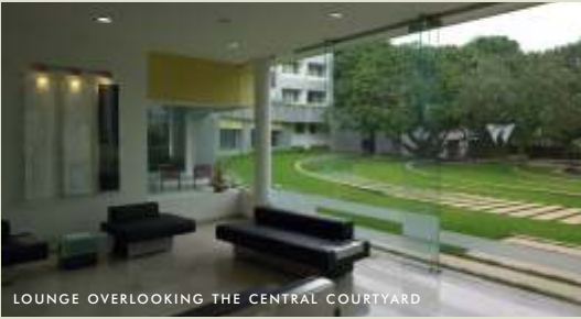
LOUNGE OVERLOOKING THE CENTRAL COURTYARD

The most famous waterfalls in the Western Ghats are the Jog Falls, the highest falls in Asia. Though Jog Falls is 210 km from Chikmagalur, its sheer scale and majesty makes the trip worth the effort. The falls are formed when the waters of the Sharavati river come cascading down a drop of 852 feet. Four separate falls are created in the process, known locally as Raja, Rani, Rocket and Rover. The Linganamakki Dam is located upstream. When its sluice gates are closed, it is possible to walk to the very bottom of the gorge.