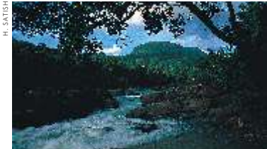
The Bhadra, which joins the Tunga at Kudali near Shimoga, to become the Tungabhadra river

One of the holiest and most important Hindu pilgrim centres in India, Sringeri is located amidst the forests of Chikmagalur, on the left bank of the Tunga river. It was the first of the four great Mutts started in the 8th century by Adi Shankaracharya, founder of the Advaita philosophy, for revival of the Hindu religion. Vidyaranya, who inspired the founding of the fabled Vijayanagar Empire, was a Jagadguru at Sringeri.