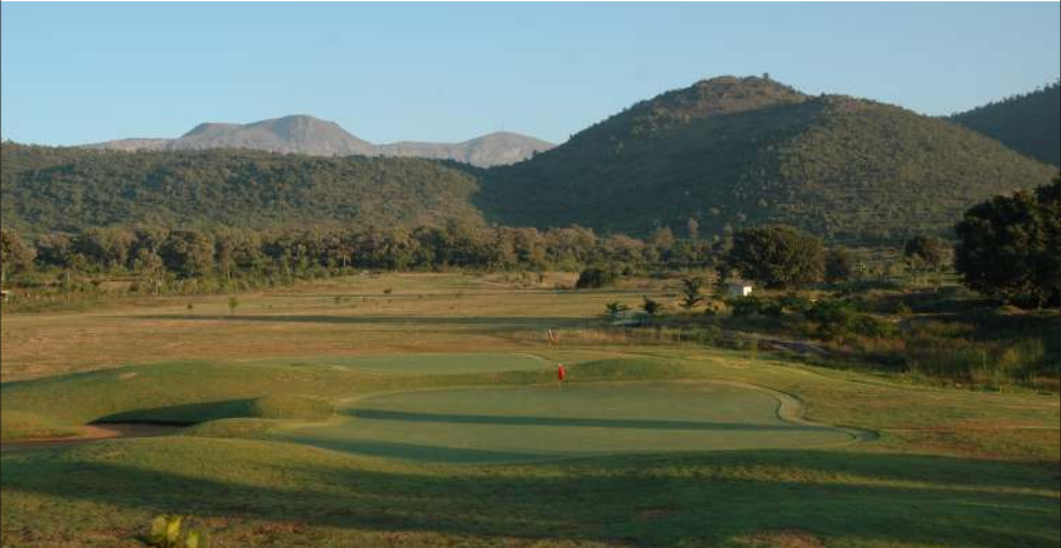
9-hole golf course of the Chikmagalur Golf Club