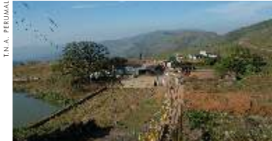
Inam Dattatreya Peetha, Baba Budangiri

Chikmagalur district has some of the most impressive ranges of the Western Ghats. Covered by deciduous and semi-evergreen shola forests and fed by rivers, streams and waterfalls, the mountain ranges here have some of the highest peaks between the Himalayas and the Nilgiris. The highest of them all is Mullayyanagiri, 1925 metres above sea level. The other lofty peaks include Baba Budangiri (1894 m), Kalhatgiri (1876 m) and Kudremukh (1894 m).