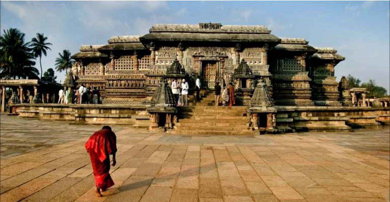
A devotee bowing reverentially in front of the Chennakesava Temple, Belur (enroute from Bangalore, 22 km before Chikmagalur)