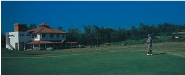
Golf course and clubhouse

A visit to the Chikmagalur Golf Club is a must on the itinerary of every golf enthusiast who visits the region.