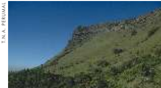
North-western view from the resort site

When Brigade Hospitality Services decided to set up a resort, we looked for a spot that would have a breathtaking natural setting, be pleasantly removed from the noise and confusion of modern life and yet be close to places of tourist interest. We found such a site, right next to our own coffee plantations, near our home town Chikmagalur.