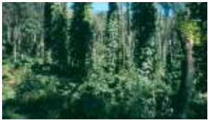
A view of our coffee estate, adjacent to the resort site

With its natural beauty, sports and entertainment facilities, luxury accommodation, fine cuisine, and proximity to places of tourist interest, the Cascades Hill Resort & Spa will be an ideal holiday destination. One that is easy to reach, but hard to leave. (Read more about how we are turning our vision into reality on page 12.)