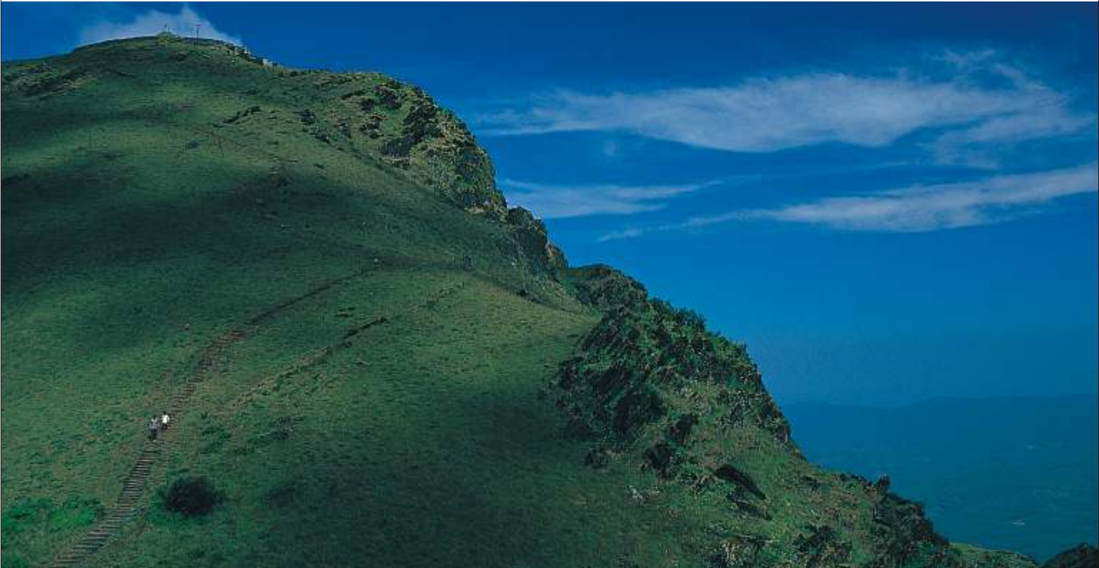
Mullayyanagiri peak (10 km from Chikmagalur)