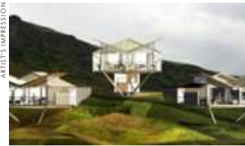
Some of the rooms and villas at the Cascades Hill Resort & Spa

We felt the best way to arrive at a truly unique design for our hill resort would be through an international architectural competition. This would allow us to tap the minds, imaginations, design skills and experience of professionals from