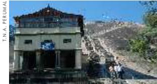
Steps going up Indragiri Hill

Sravanabelagola is the site of the world's tallest monolithic statue. Standing 58 feet high and carved from a single rock, the statue of Gomatesvara was sculpted in 981 A.D. It can be seen from a distance of 24 kilometres. The statue was commissioned by the Ganga King Rachamalla, created by the sculptor Aristanemi and erected under the supervision of his general Chavundaraya.