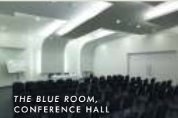
THE BLUE ROOM, CONFERENCE HALL