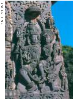
Part of a frieze, Hoysalesvara Temple, Halebid

The most remarkable amongst the Hoysala temples are the ones at Belur, Halebid and Somanathpur. And of these, the Hoysalesvara temple at Halebid, dedicated to Lord Shiva, is considered the greatest; representing the pinnacle of their artistic and architectural achievements. According to art historian James Fergusson, "It is one of the most marvellous exhibitions of human labour to be found even in the patient east". Work on the Hoysalesvara temple commenced in 1121 A.D. and continued for 86 years—despite which it was never completed. Fergusson remarks that, "The great temple of Halebid, which, had it been completed, is one of the buildings on which the advocate of Hindu architecture would desire to take his stand". Almost overwhelming in its artistic detail and creative vision, the temple is covered, inside and out, with a profusion of friezes and carvings depicting Hindu gods and goddesses, sages, birds, animals, and scenes involving war, hunting, agriculture, dance and music.