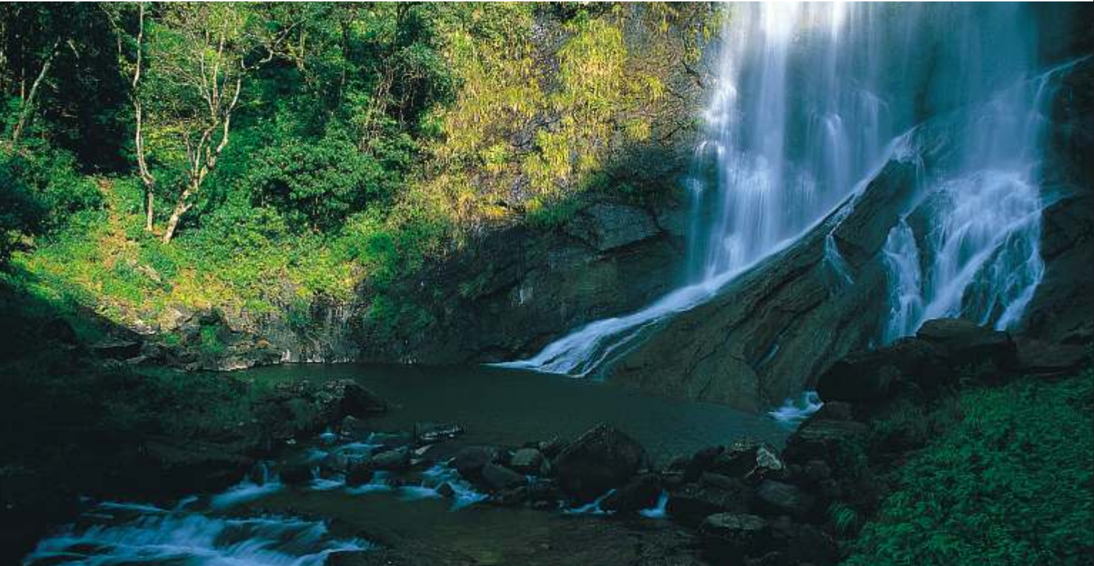
Hebbe Falls, Kemmangundi (55 km from Chikmagalur)