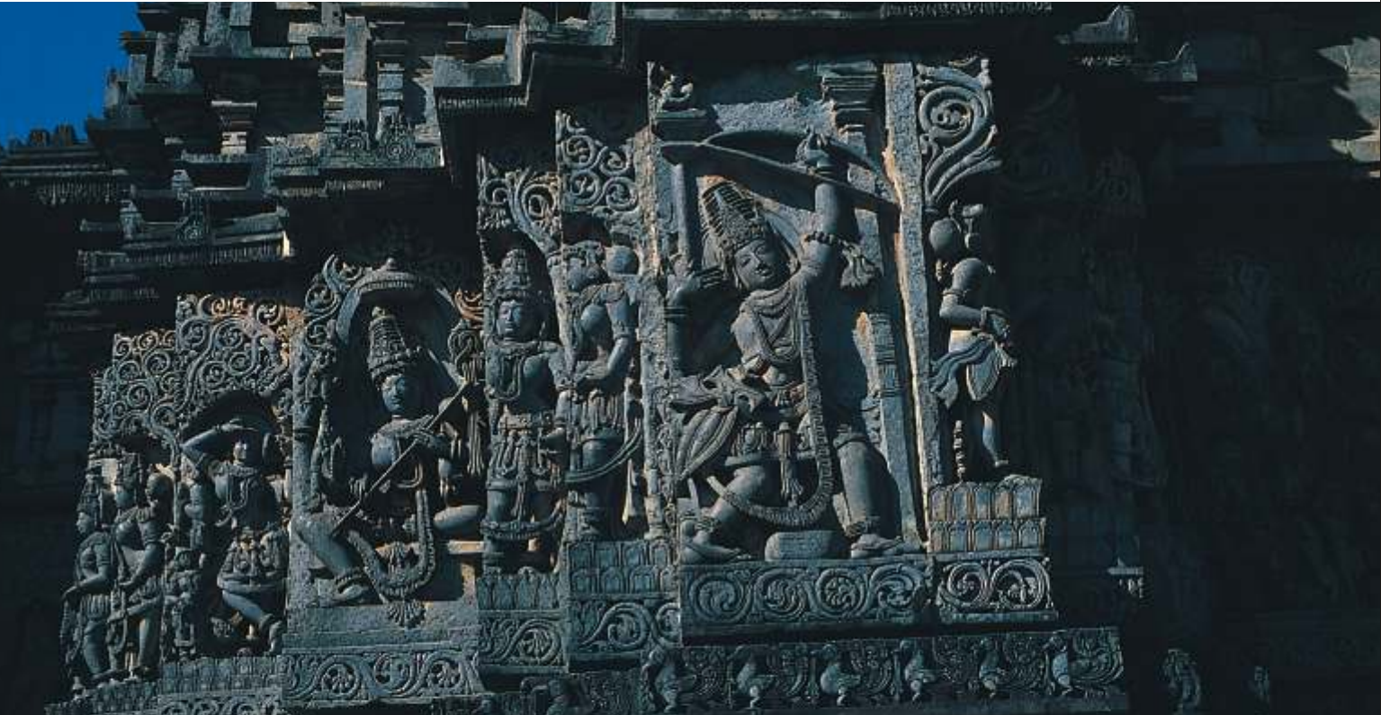
A frieze on Hoysalesvara Temple, Halebid (36 km from Chikmagalur)