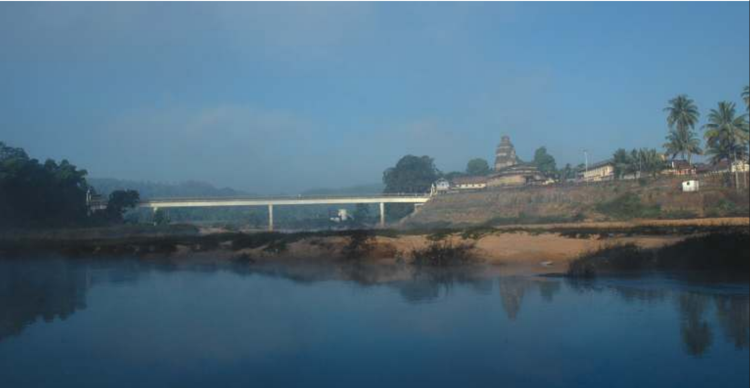
Sringeri, on the banks of the Tunga (90 km from Chikmagalur)