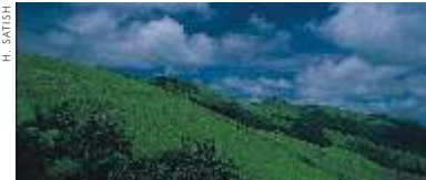
Shola forests on the slopes of Kemmangundi

At a height of 1434 metres above sea level, Kemmangundi is a small and charming hill station located in the Baba Budan mountain range. It is also known as K.R. Hills, in honour of Krishnaraja Wodeyar IV,