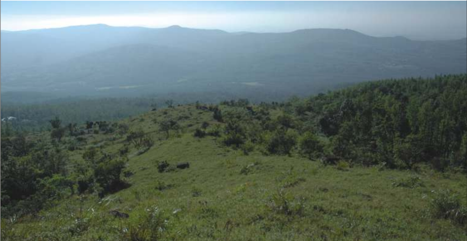
Southern part of the Cascades Hill Resort & Spa site