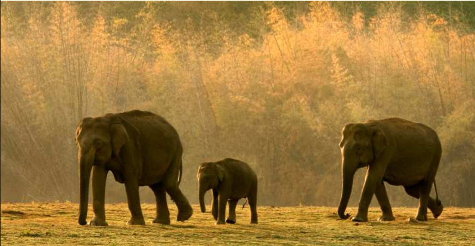
Elephants, Muthodi Wildlife Sanctuary (32 km from Chikmagalur)