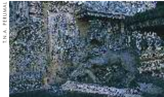
The symbol of the Hoysala dynasty—the boy Sala killing the tiger

History is unclear as to what spurred these magnificent artistic and architectural efforts at Belur, Halebid and Somanathpur: it could have been to commemorate King Vishnuvardhana's conversion from Jainism to Vaishnavism or to celebrate his victory in wresting Talakadu from the Cholas.