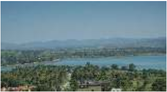
Lake near Hoysalesvara Temple, Halebid

The Hoysalas, who ruled over parts of Karnataka between 1000 and 1346 A.D., were great warriors and prolific temple builders. A legacy of over 1,500 temples in 958 centres attests to their vision, craftsmanship and inspired artistry.