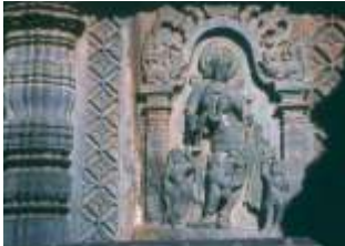
Sculpture, Chennakesava Temple, Belur