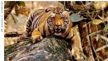
Tiger, Muthodi Wildlife Sanctuary

The sanctuary comprises the Muthodi area, lying inside the crescent, and the Lakkavalli area, spread across the northern outer slopes of the Baba Budan mountains. The sanctuary was brought under Project Tiger in 1998. While the sanctuary is open throughout the year, the best season for spotting animals is between October and February.