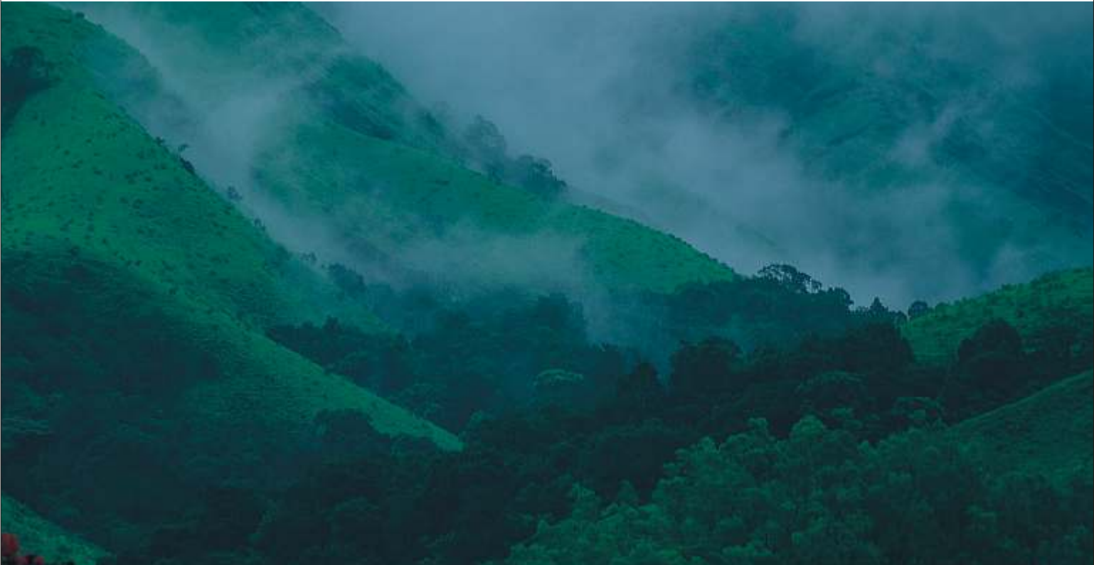
A view of the Kudremukh range (95 km from Chikmagalur)