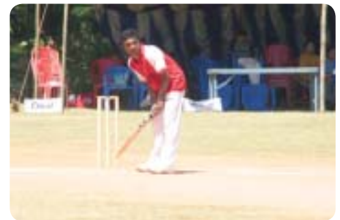
A cricket match in progress.