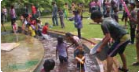
Holi celebrations in The Woodrose Central Courtyard.

Holi was celebrated in true traditional fashion. Festivities featured thandai , special gujja , songs and lots of fun-moments—followed by a typical sumptuous Holi lunch.