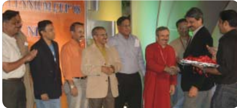
Brigade Millennium Cup Awards function.