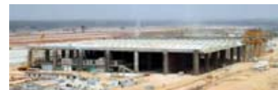
Terminal building under construction (3 April)

The opening date of the new International Airport at Bangalore, as fixed by M/s Bangalore International Ltd (BIAL), is 2 April 2008.