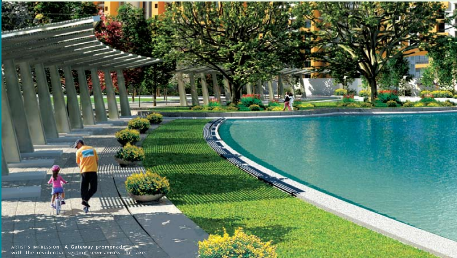
ARTIST'S IMPRESSION: A Gateway promenade with the residential section seen across the lake.

For a better quality of life, upgrade to Brigade.