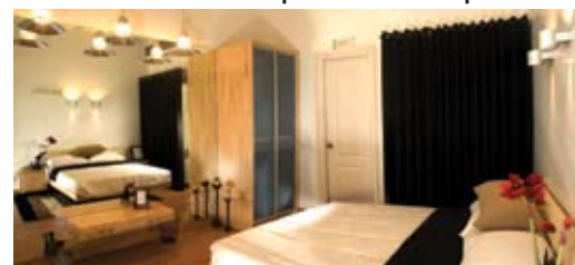
Model apartment at Brigade Gateway

The newest wing at Brigade Gateway is now open for booking. The Andromeda wing overlooks the lake in the enclave and comprises large, 4-bedroom luxury apartments, with the finest design and specification standards.