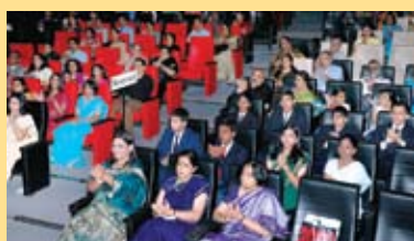
Parents at the graduation ceremony