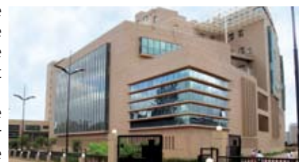
Brigade TechPark, Whitefield

According to the report, the IT/ITES sector accounts for over 70% of total office space absorbed in this quarter. Rising demand from corporates and the IT/ITES sector has led to an increase in rental values. The absorption figures for Bangalore are the highest in India.