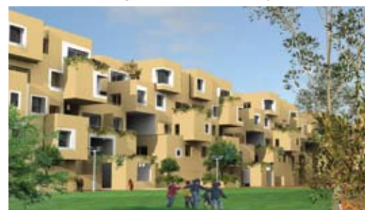
Artist's impression of Brigade Courtyard