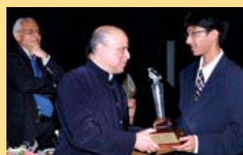
The valedictorian for the year receiving the Best Outgoing Student award