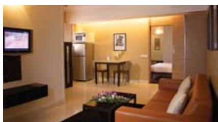
Serviced residence at Homestead 2, Jayanagar