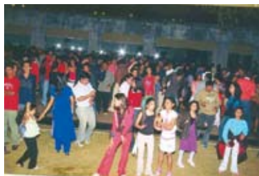
New Year's eve

The Woodrose is already a year old and has grown considerably in size and spirit. Several new facilities are functional now and the bustle of activities continues to increase. The Woodrose is also now affiliated to many clubs in South India as well as in Mumbai, Pune and Indore.