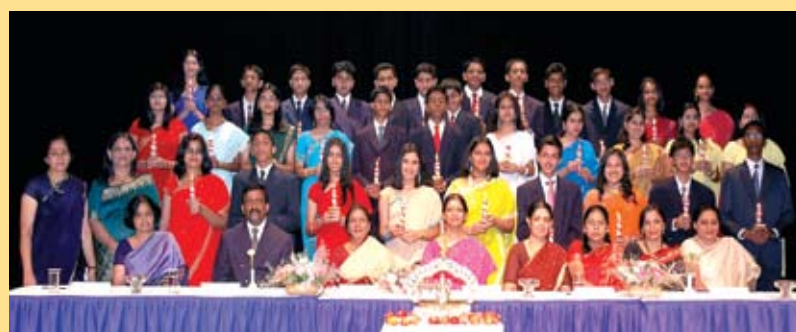
The first graduating class with the teachers