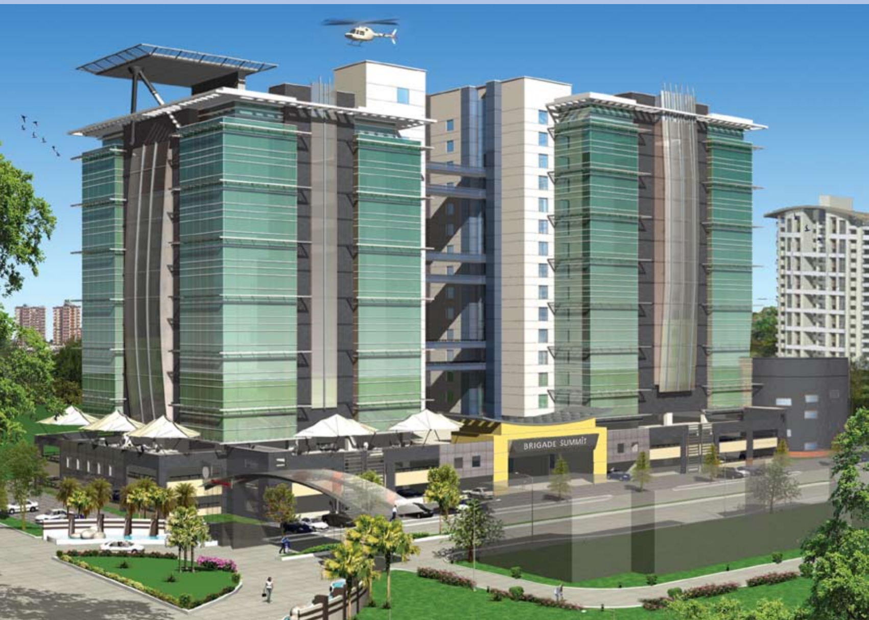
ARTIST'S IMPRESSION OF SUMMIT 1 AND 2, BRIGADE METROPOLIS