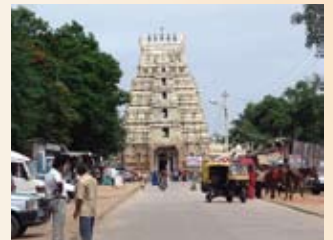
Sri Rangaswami Temple

It is in the nature of human beings to value the natural world in different ways; to invest it with special meaning and symbolism. The river Kaveri is no exception. On a practical level it is vital to irrigation, power generation and everyday living; in a more esoteric sense, it is sacred to mythology, history and human emotion.