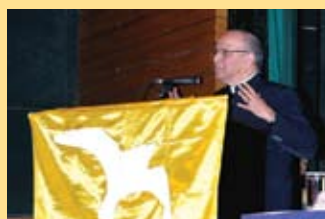
Dr K. Kasturirangan addressing the audience

At a moving graduation ceremony—held on 8 February at the MLR Convention Centre, Brigade Millennium campus—The Brigade School bid adieu to its first outgoing batch of students.