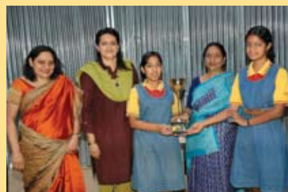
Best Class of the Year—Class 7 A