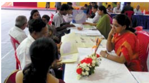
Brigade marketing team in discussion with visitors to the launch

Phase 2 of Brigade Metropolis—our integrated enclave on Whitefield Road—was launched with a 3-day event, on 5, 6 and 7 January, at the project site. The fest marked the launch of a fresh set of 2- and 3-bedroom apartments, in five new blocks of the enclave, and was very well received by visitors to the event.