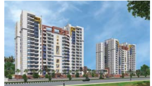
Artist's impression of Brigade PalmSprings

Brigade PalmSprings is located at J.P. Nagar. It has exclusive 3-bedroom apartments with a clubhouse, swimming pool and landscaping.