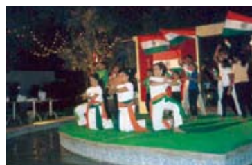
Republic Day celebrations