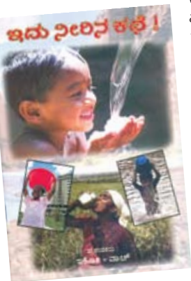
The book sponsored by Brigade and produced by Eco Watch for the World Water Year campaign

We are spreading awareness about the water shortage crisis through schools, corporates and the media. We are also making a short documentary on polluted ground water. We use bore wells to tap the ground water. Sewage and effluents are dispatched to lakes, which in turn charge the ground water with polluted water. This results in outbreaks of illnesses. People are not aware of the chain reaction.