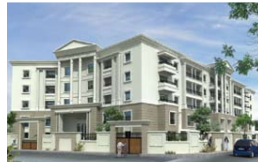
Artist's impression of Brigade Solitaire

We held the groundbreaking ceremony for three new projects on 15 April. Brigade Citadel , in Yadavagiri, features 3- and 4-bedroom luxury apartments. Brigade Horizon , in Siddhartha layout, offers 2- and 3-bedroom luxury apartments. Brigade Solitaire , offering 2- and 3-bedroom apartments, is located behind Lalitha Mahal Palace.