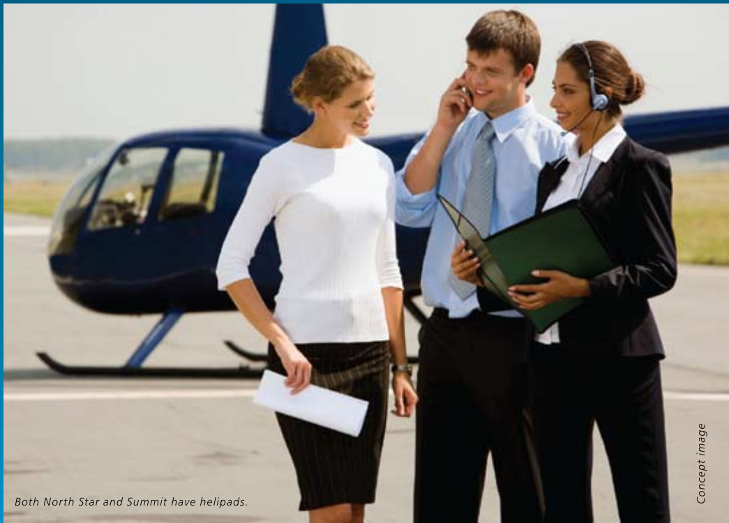
Both North Star and Summit have helipads.