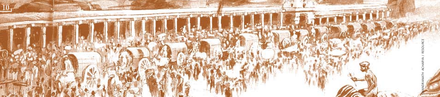
CHANDRANATH ACHARYA / RESOURCE