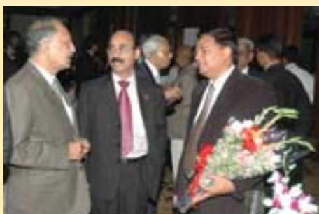
A get-together to celebrate Brigade's IPO @ Taj West End, on 22 January 2008