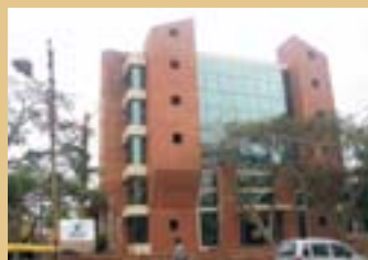
Brigade Point, Gokulam Main Rd Office and retail space