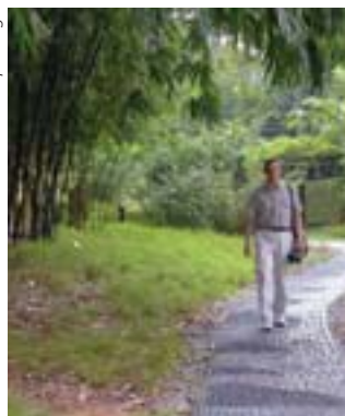
A reflexology path

One of the chief features of a Reflexology garden is a path or walkway designed to stimulate specific points on the feet, for a healing effect on specific parts of the body or for improved general health. As per reflexology beliefs, this must be done barefoot for any effect. When such paths are interwoven into a larger garden environment, the benefits are not only to physical health, but to the eyes and mind as well.