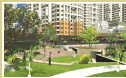
Brigade Metropolis Mahadevanpura, Whitefield Road 40-acre integrated enclave 2- and 3-bedroom apts 1290 sft to 1960 sft

Is this a garden complex or a residential project?