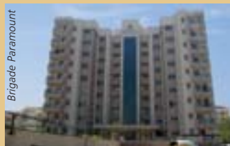
Brigade Paramount, Old Madras Road