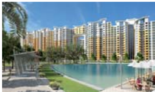
A Gateway promenade with residential blocks across the lake