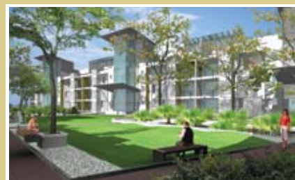
Brigade Petunia Jayanagar-Banashankari 3- and 4-bedroom premium residences 3150 sft to 4500 sft

LANDSCAPING BETWEEN THE RESIDENTIAL TOWERS AT BRIGADE METROPOLIS. TWO OF THE TOWERS ARE SEEN IN THE BACKGROUND