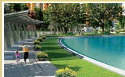
Brigade Gateway Malleswaram-Rajajinagar 40-acre lifestyle enclave 2-, 3- and 4-bedroom apts 1310 sft to 3310 sft