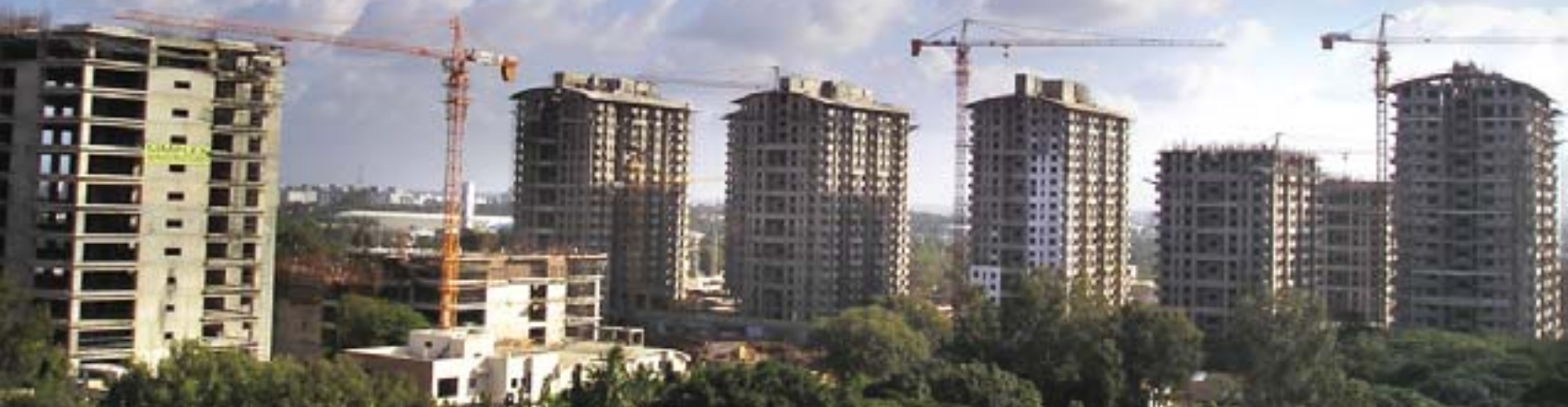
The residential blocks coming up at Brigade Metropolis, Whitefield Road. Construction is also in progress at Brigade Gateway, Malleswaram-Rajajinagar.