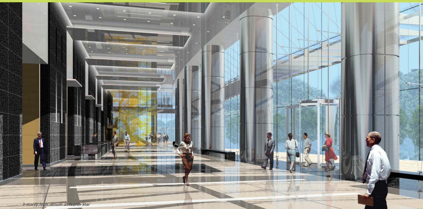
3-storey high atrium at North Star

State-of-the-art Retail & Commercial Facilities