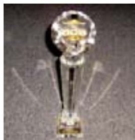
The ET ACETECH 2007 trophy

The function, termed "The Leaders of Indian Infrastructure and Construction", felicitated architects and real estate developers for their immense contribution to the field of construction and environment-friendly architecture.