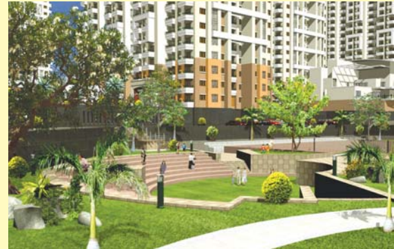
Brigade Metropolis , Whitefield Road 40-acre integrated enclave 2- and 3-bedroom apts, 1290 sft to 1960 sft