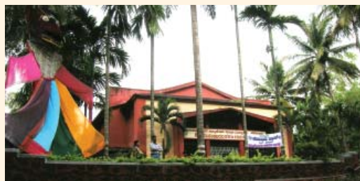
Shivarama Karantha Rangamandira, Heggodu

The now-famous NINASAM Culture Camps were started to initiate reflection and discussion on different themes. These seminar-discussions are