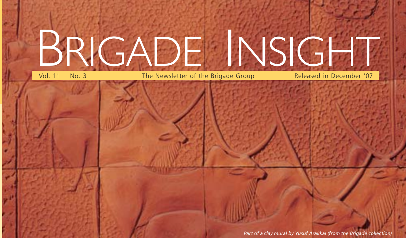
Part of a clay mural by Yusuf Arakkal (from the Brigade collection)