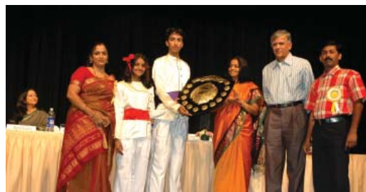
The Best House Trophy for the cultural competition was bagged by Vijaynagar House.