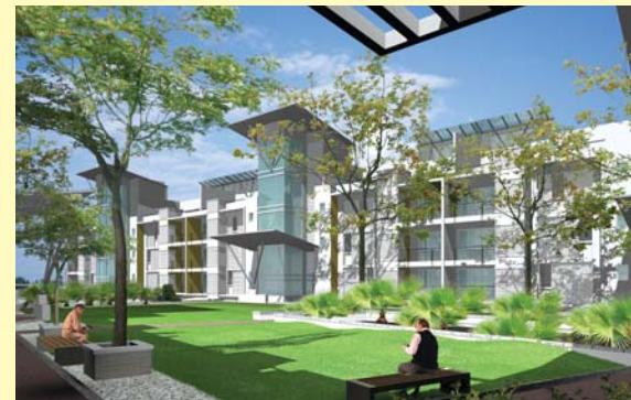
Brigade Petunia , Jayanagar-Banashankari 3- and 4-bedroom premium residences 3150 sft to 4500 sft