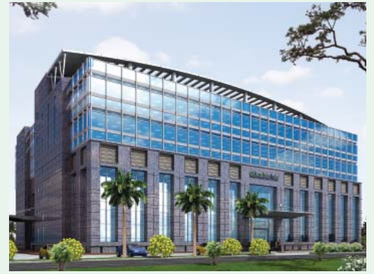
Columbia Asia Hospital @ Brigade Gateway